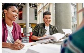
Catch-up: 16-19 year-olds