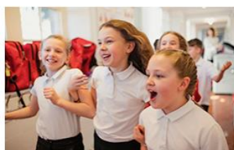
Catch-up: 4-16 year-olds