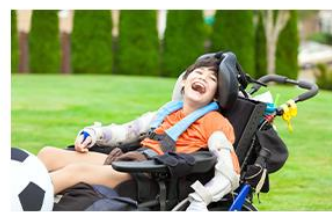
Support for SEND